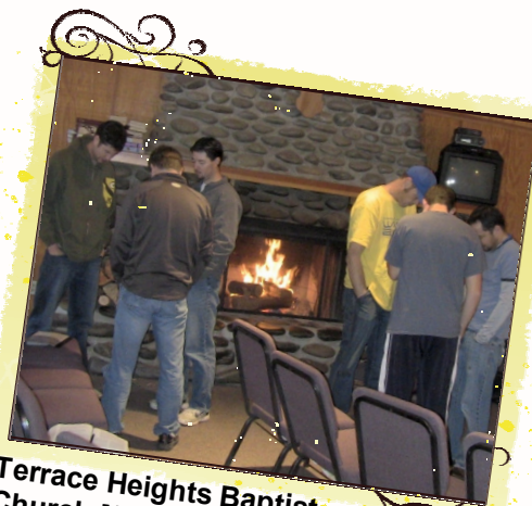
Terrace Heights Baptist Church Men's Retreat — Prayer

and faith in God, cry out for the Lord to move during corporate times of worship. We share this with you to spur you on, possibly to give leadership to something similar in your church. What if every church began to mobilize intercessors from Sunday School classes to pray during the music portion of their worship services each week?