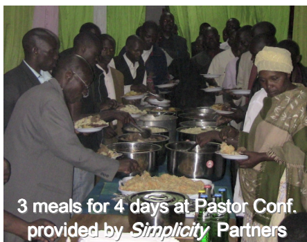
3 meals for 4 days at Pastor Conf. provided by Simplicity Partners