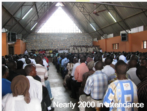
Nearly 2000 in attendance