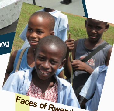
Faces of Rwanda