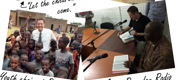
Youth choir at Rwandan church