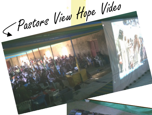
Pastors View Hope Video