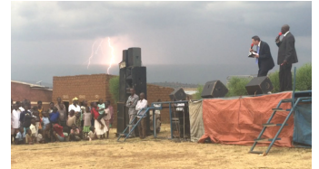
2 Day Crusade