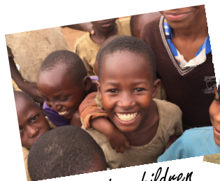
"Let the children come."