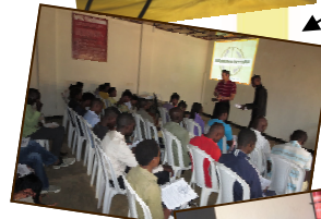
ERM Graduates trained in Simple Evangelism ...