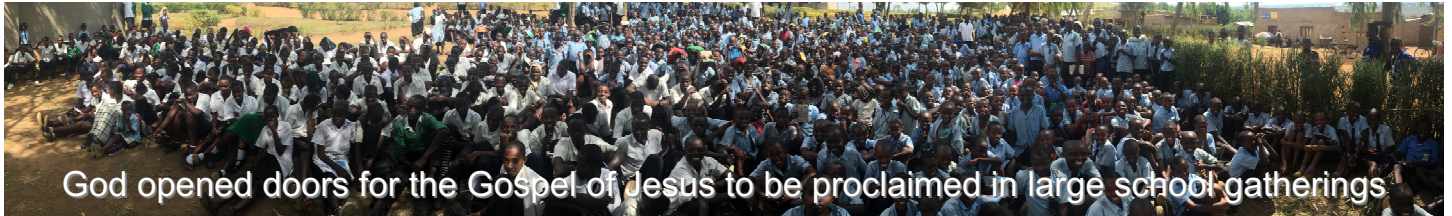
God opened doors for the Gospel of Jesus to be proclaimed in large school gatherings